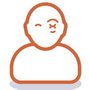
Swelling around the site of the bug bite

Children sometimes develop a swollen eyelid on the side of the face that was bitten. Even though these symptoms may go away after a few weeks, the infection may remain for years, sometimes causing serious problems.